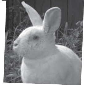
Frederic (top) and Kenzie