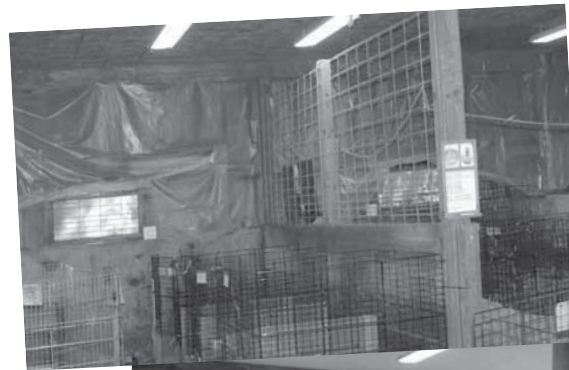
The Bunny Barn before and after.