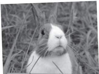
Blossom (top) and Ozzie

As we told you in our holiday letter, 2007 brought much growth and development for Great Lakes Rabbit Sanctuary. We were already the largest rabbit sanctuary in the United States, but when 108 Reno rabbits needed to be relocated from a sanctuary in Washington state, we took them in.