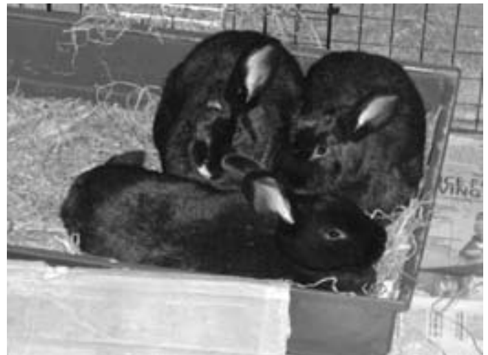
Uno relaxing with Pandora and Orion.

Uno maintained one of the sweetest attitudes of any bunny at the sanctuary, constantly asking for snuggles and giving kisses in return. It was obvious despite his injuries he still loved life. He became a favorite amongst the volunteers and staff.